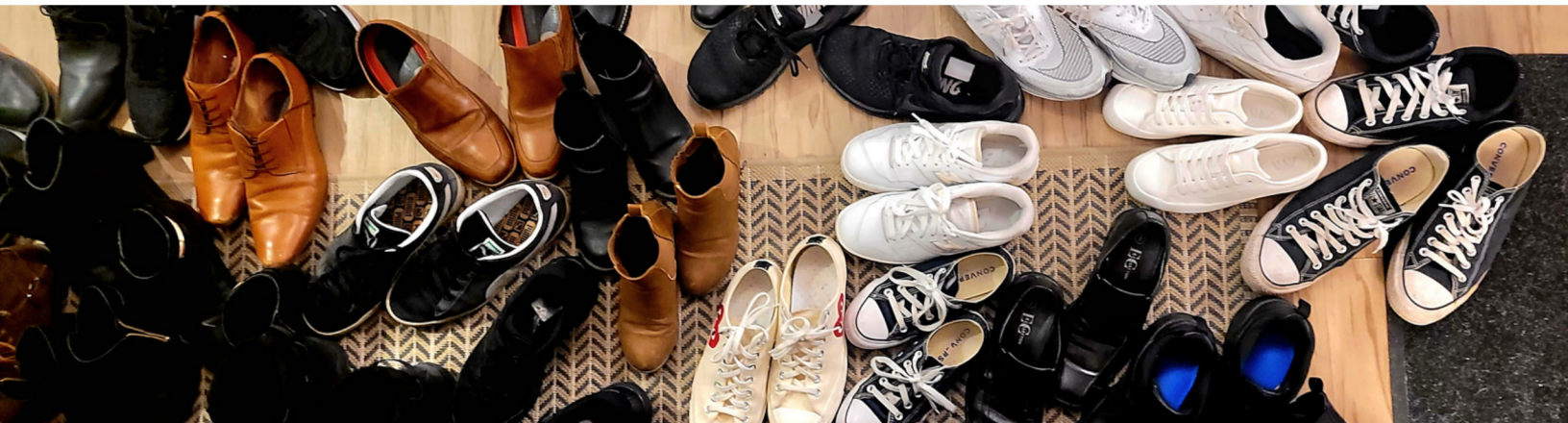
A place to take your shoes off... Over twenty family members would gather at Candace House each day

"Going into court itself there was a lot of unknowns. What are we going to be doing, what are we going to see, how long will this take. We went there to witness the trial and also be witnesses, to testify in trial. Mentally, it was not easy. We learned things we wanted to know but was difficult to hear... You're sitting there trying to be composed while also being in front of the person accused of doing this to your family."