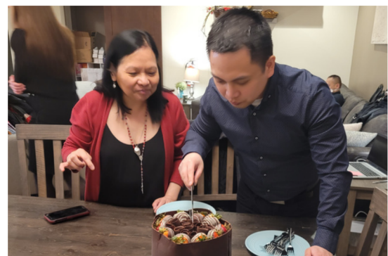
Sharing fresh snacks, making art, and honouring memories, Candace House is a place to just "be human."

During lunch, everyone would gather over a meal provided by Candace House, helping reduce the practical and financial burden that families are otherwise left alone to carry.