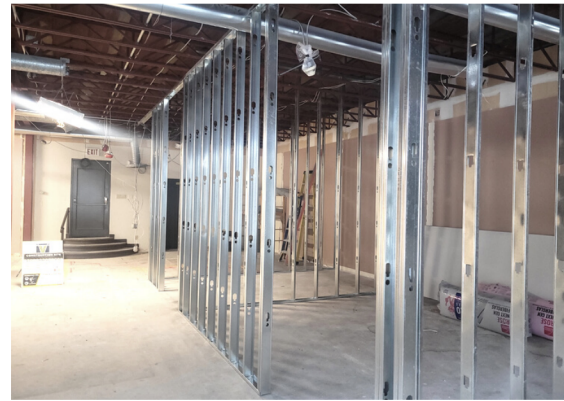
Demolition and renovations are underway!

We are so grateful to all the incredible donors who have already extended their tremendous generosity to support our campaign. Thank you for all that you do!