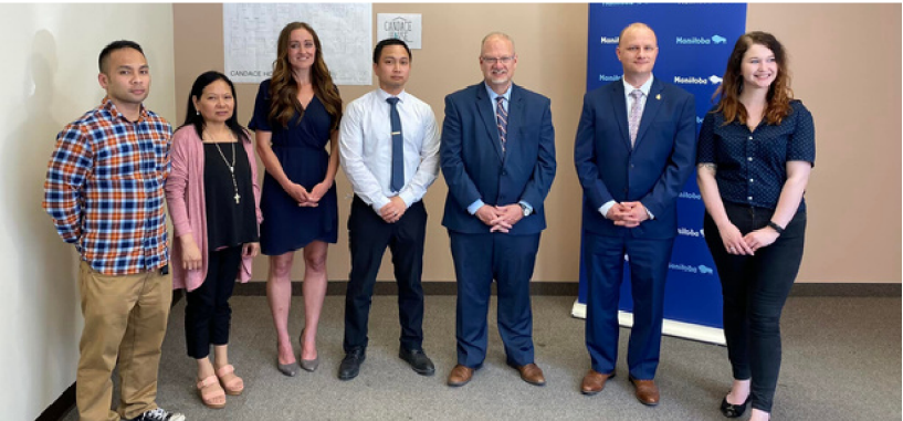
Candace House expansion media conference

As the jury finally began their deliberations several weeks later, everyone huddled together at Candace House, anxiously waiting. When the call came that a verdict had been reached, all the breath left the room. Tears of stress and fear flowed as we walked to court. Then as the jury read out the guilty verdict, tears of relief mixed with deep pain – No matter what the verdict, Eduardo was not coming back.