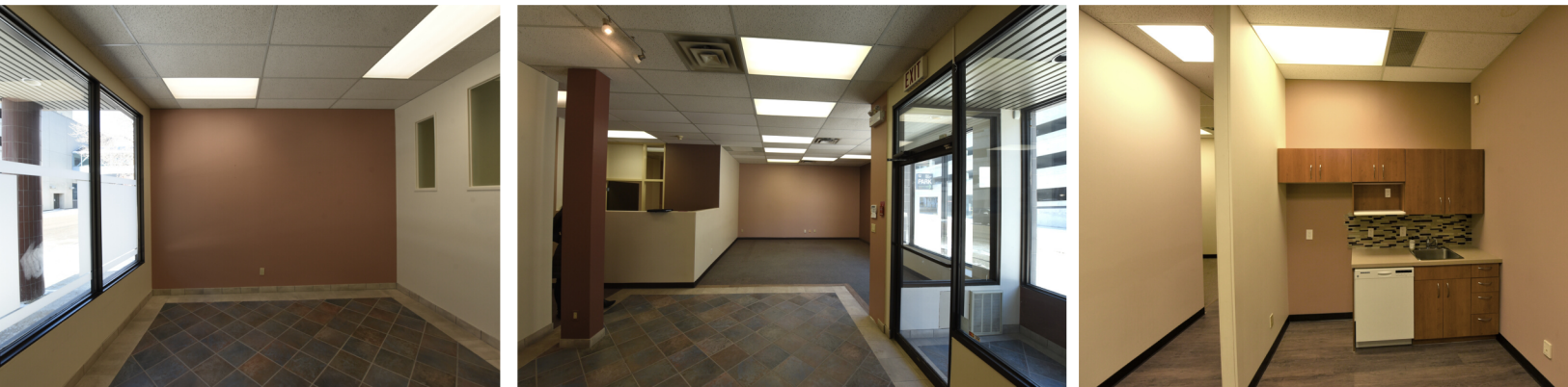
"Before" photos of Suite 1A at 183 Kennedy Street

Then as COVID dragged on, an opportunity arose to take over the front suite of the building we already occupy. In the spring of 2022, Candace House signed a lease and took possession of Suite 1A. The timing could not have been more perfect or critical.